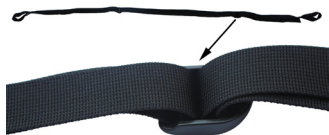
Buckle Side Down

1-Place the first strap buckle-side down (Fig 3). Run the strap's loop-end (without twisting the strap) through the back side of a Car Clip (Fig 4).